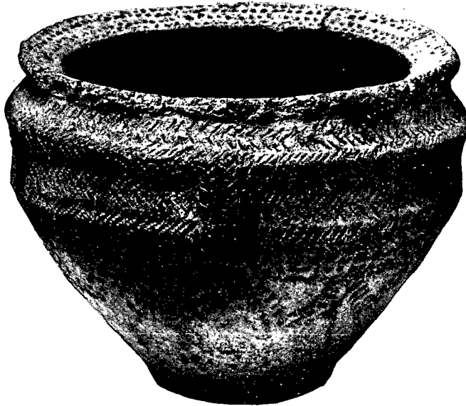
Fig. 4. Urn found at Flawcraig ( \frac{1}{2} ).

Food-vessel Urn, 4.7 inches in height, with a groove round the shoulder interrupted by five imperforated flat stops, found with an incinerated interment in a short cist at Flawcraig farm, Kinnaird, Perthshire.