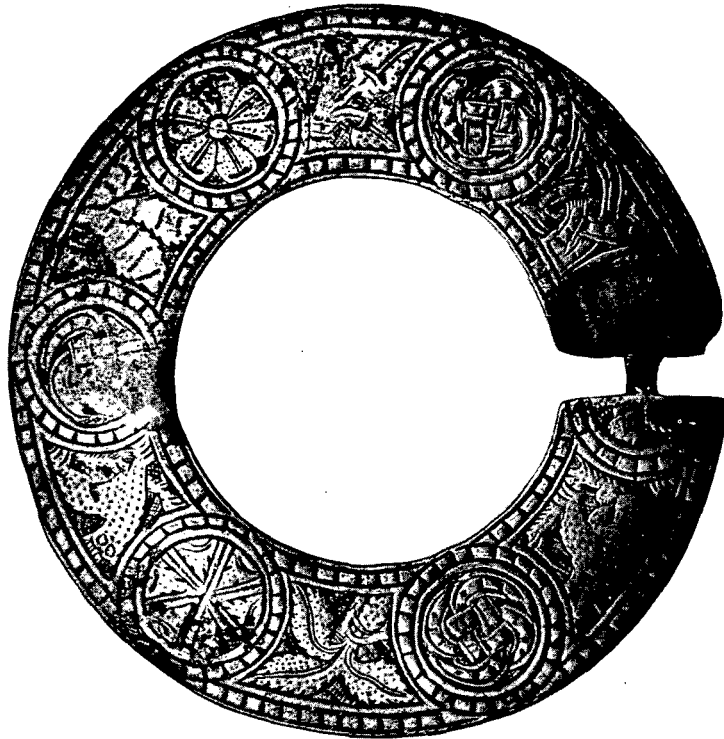
Fig. 2. Highland Brooch of Brass (3).

A collection of Flint Objects, an Urn with a narrow groove immedi-