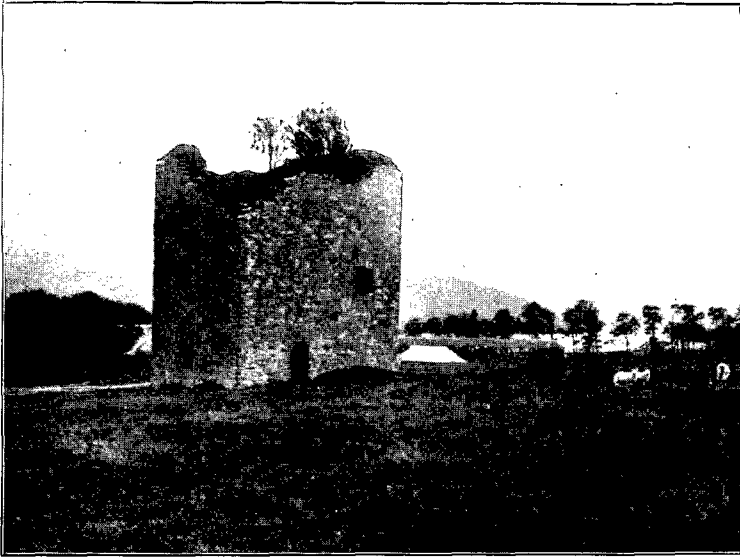
Fig. 1. Dryhope Tower.

Mary's Loch, and in full view from the main public road. The glens of Dryhope Burn and Kirkstead Burn unite, and form a wide, open valley more than half a mile square, and looking out to the south over the lower end of the loch. The tower stands on a small rising plateau at the head of this valley, and near the west bank of the Dryhope