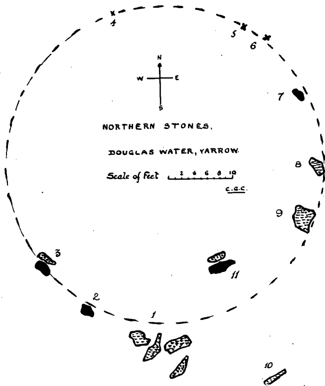
Fig. 3. The Northern Group of Standing Stones, Douglas Water, Yarrow.

occurred at all, might have taken place near them. But again, the stones are so far from the hill road that there is no reason why the eloping couple should have gone near them; and as they are a bare