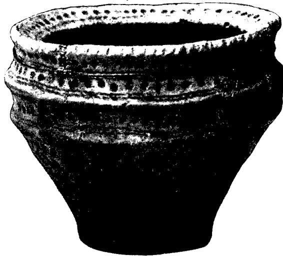
Fig. 2. Urn of Food-vessel Type from Cockburn Mill Farm.

Urn of Food-vessel type (fig. 2), found in a cist on Cockburn Mill