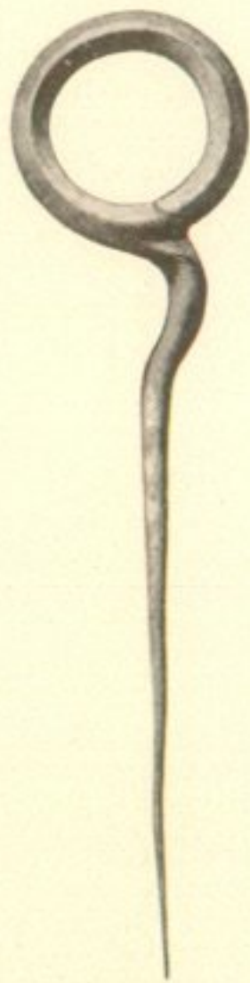
Fig. 2. Bronze Pin from Carsphairn ( \frac{2}{3} ).