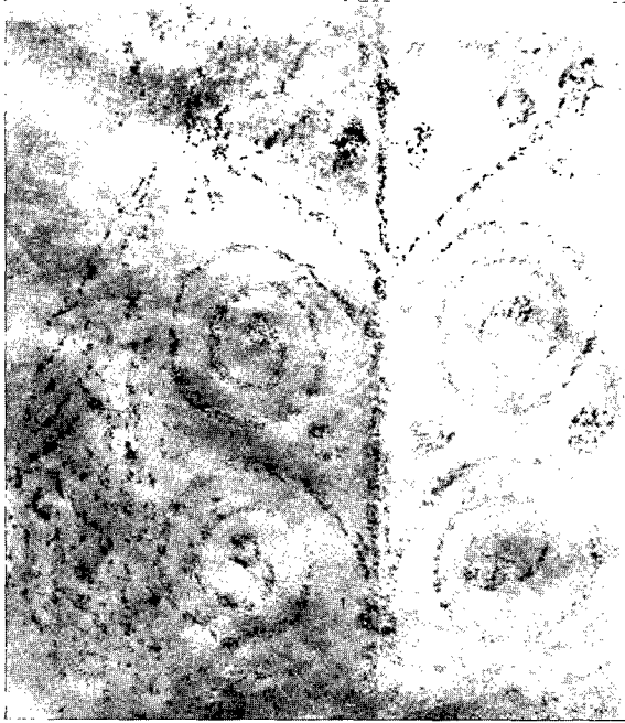
Fig. 2. Portion of Slab with sculpture in relief.

Rubbing of part of the top surface of a large boulder found in a clay-pit on the farm of Wester Craigland, parish of Rosemarkie. It shows a group of cup-markings, about 2\frac{1}{2} inches in diameter, set close together, and twelve in number, hence known locally as "The Twelve Sons of Jacob."