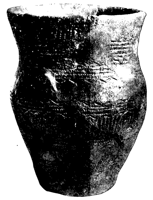
Fig. 3. Urn from the Central Cist in the Trewhitt Barrow.

pressure of the superimposed earth and stones, allowed surrounding material to gradually work its way inside. This fine earth having been removed by hand, a vase was disclosed lying on the bottom stone with its base close to the west side and its mouth towards the