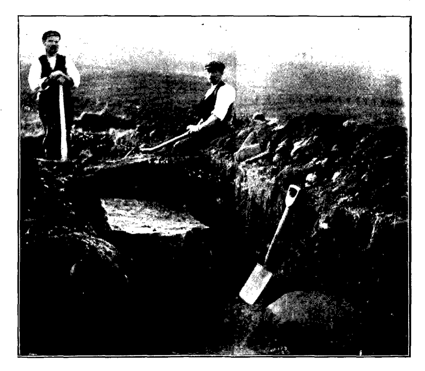
Fig. 4. The Western Cist in the Trewhitt Barrow.

direction following the crest of the tumulus. Pieces of stone blackened by fire were found here and there, and at a distance of 6 feet from the first a second and larger cist was encountered 18 inches below the surface. The illustration (fig. 4) was taken after one side-stone,