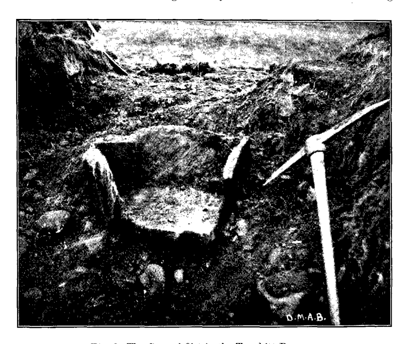
Fig. 2. The Central Cist in the Trewhitt Barrow.

varying in thickness from 1\frac{1}{4} inch to 2\frac{1}{2} inches. The cover, on which lay a smaller stone, measured 25\frac{1}{2} inches by 24\frac{3}{4} inches, the depth of the cist being 12 inches, and the bottom formed of a single slab 2 inches thick, this being the only instance of a floor stone being