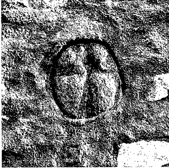
Fig. 8. Cross at Freemasons' Hall, Inverurie (No. 3).

when the hall was erected in 1881, whither it had been removed from an old house which formerly stood near the southern end of Inverurie, where Cunning Hill Road meets the High Street. This building had been used for some time as a Dissenting chapel, and subsequently as a meeting-place for the local Freemasons' lodge. Afterwards it