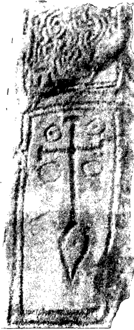
Fig. 13. Cross with peculiar base at Kirkmadrine.

no known cross exists in Aberdeenshire with a similar base, yet such an one occurs in the churchyard of Kirkmadrine, in Wigtownshire, where a heart-shaped or leaf-shaped base is clearly part of the design (fig. 13). This stone is preserved at the right-hand side of the niche in which