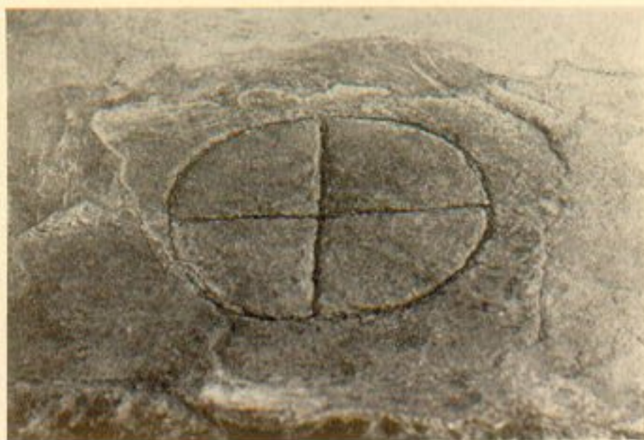
Fig. 10. Stone with incised Cross at Monymusk (No. 2).