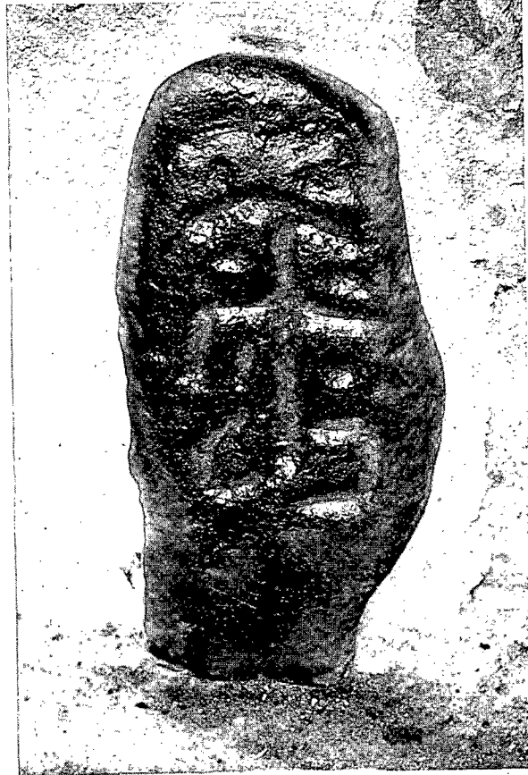
Fig. 2. Cross of peculiar form at Dyce (No. 4).

of the shaft bending slightly downwards. The second pair is placed a little above the middle of the shaft. Each arm of the second pair