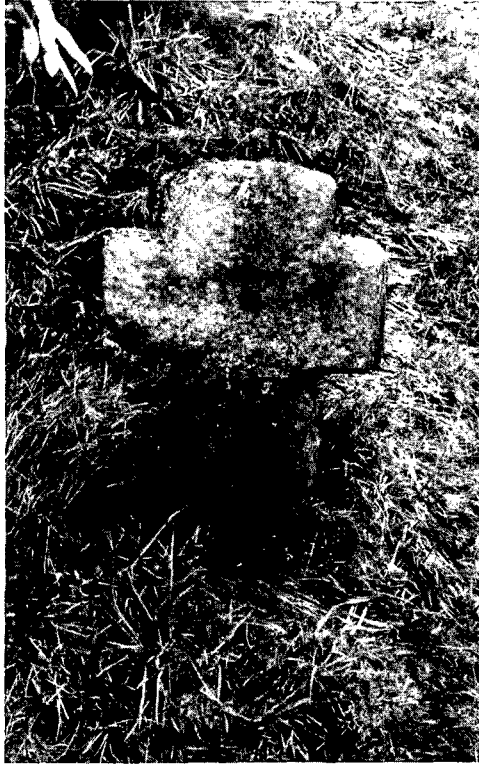
Fig. 3. Cross at St Medan's (No. 1).

it. Both figures, however, seem to be part of one original design, for they are carved with equal care, and balance each other on the face