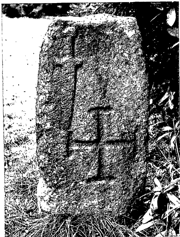
Fig. 4. Stone with Sword in relief and Cross incised, at St Medan's (No. 2).

to side, and it appears to have been used as a flat stone covering over a grave. It measures 5 feet 9 inches long and 1 foot 6 inches broad,