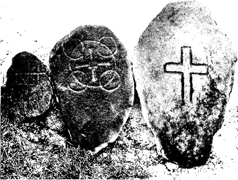
Fig. 1. Stones with incised Crosses at Dyce (Nos. 1, 2, 3).

it is incised is 2 feet 11 inches high, 1 foot 10 inches broad, and 1\frac{1}{2} inches thick. The cross is formed by an incised line about \frac{1}{2} inch wide which forms the outline of the shaft and arms of the cross, but the ends of which are not joined at the foot. The shaft of the cross is 11 inches long, and the horizontal portion forming the arms measures