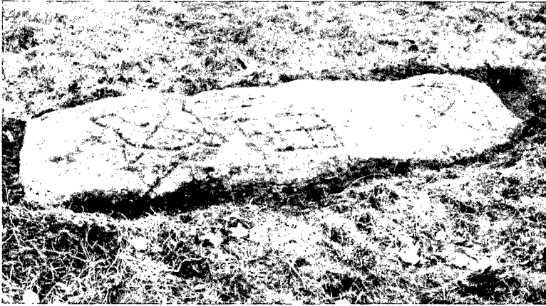
Fig. 5. Recumbent Slab with Symbols at St Medan's (No. 3).

A little below this figure, towards the left side of the stone, there is a rectangle 10 inches long and 6 inches broad, with a line drawn down the middle from end to end, and two lines crossing it from side to side, one being 4 inches from the upper end, the other 3 inches