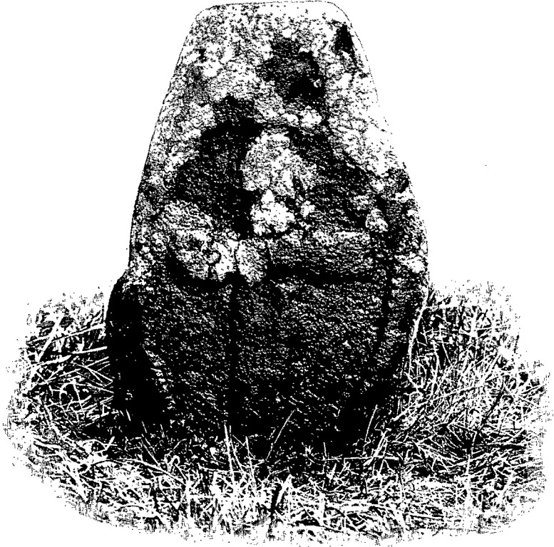
Fig. 11. Stone with Celtic Cross in relief within a sunk oval at Logie Coldstone.

The cross upon it is not unlike the small one at Logie Coldstone, though it is much larger in size. But, so far as I am aware, attention has not been drawn to the peculiar form of its base. The cross