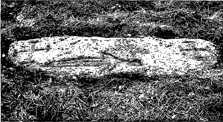
Fig. 6. Recumbent Grave-slab with Sword and Crosses at St Medan's (No. 4).

It is doubtful whether the two circular figures on this stone are intended for crosses or for emblems. If the rectangle represents a bale of wool (which is also open to doubt), then it and the shears would seem to indicate the burial-place of someone connected with the wool-mill which has existed in the immediate neighbourhood of the church-yard for a long time. It is quite possible, therefore, that the other