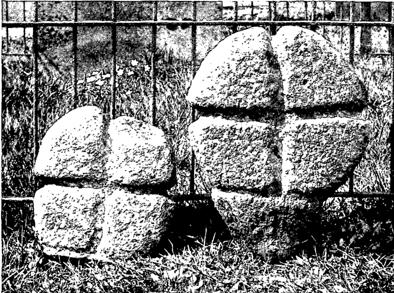
Fig. 7. Crosses at Inverurie Churchyard (Nos. 1 and 2).

position is therefore not now known. The larger one was found many years ago when a grave was being dug in the burial-place belonging to the Johnstons of Brandsbutt, and is now placed at the head of their ground, within the iron railing which surrounds it. Both of the crosses have been formed on the same plan. In each case the block of granite has been trimmed into a circular form with rounded edges,