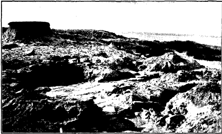
Fig. 1. View of the Hut-Circle as excavated.

commenced a day or two later. As the work progressed, the structure of the hut-circle took definite shape, and after a couple of days it was completely exposed to view (fig. 1). The walls of the dwelling were about one foot six inches in height, and were composed of stones laid in sandy soil. Towards the east the thickness of the wall was about four feet six inches, but this tapered to about two feet on the west.