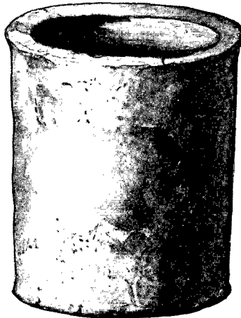
Fig. 2. Can-shaped Vessel of Clay from a Kitchen-Midden on Culbin Sands.

The kitchen-midden where the vessel was found, like nearly every