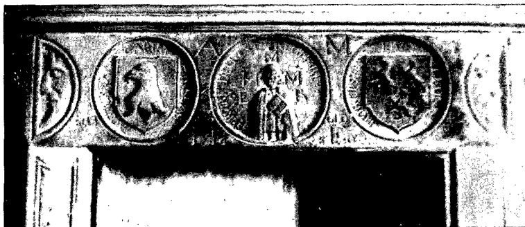
Fig. 2. Carved Stone Lintel from the Mansion-house of Daan, now at Balnagown.