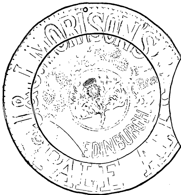
Fig. 2. The Barber's "Bleeding-dish."

Instead of immediately collapsing and considering myself thoroughly taken in, I was the more delighted still, for here, thought I, was an "ancient" mode of advertising, the making use of a barber's bleeding-dish for the purpose of heralding some particular beer—and I knew