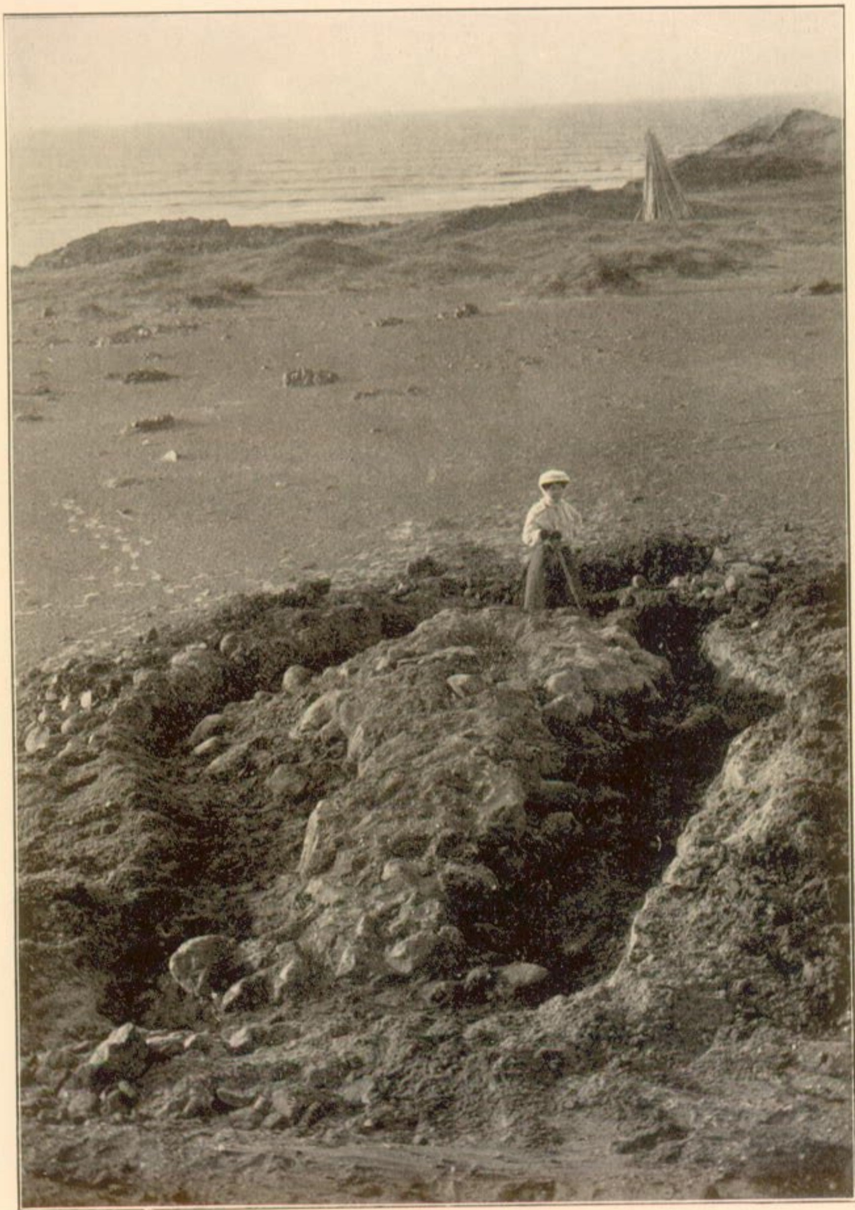
Fig. 1. View of the Cairn.