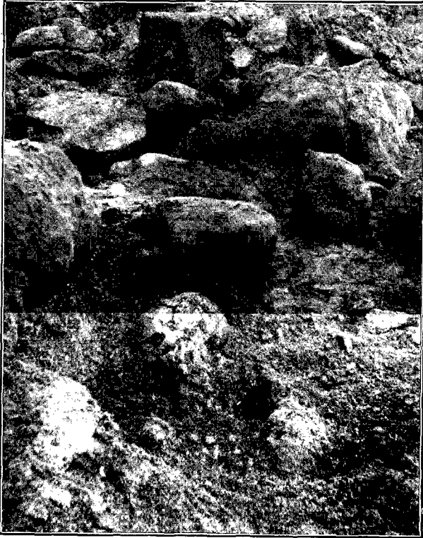
Fig. 3. Showing Skull and part of Skeleton in position.

rounded by large boulders, a sixth skeleton was discovered. In the neighbourhood of the skull, which was in perfect preservation, the presence of the coarse sand and broken shells was again noted, while the