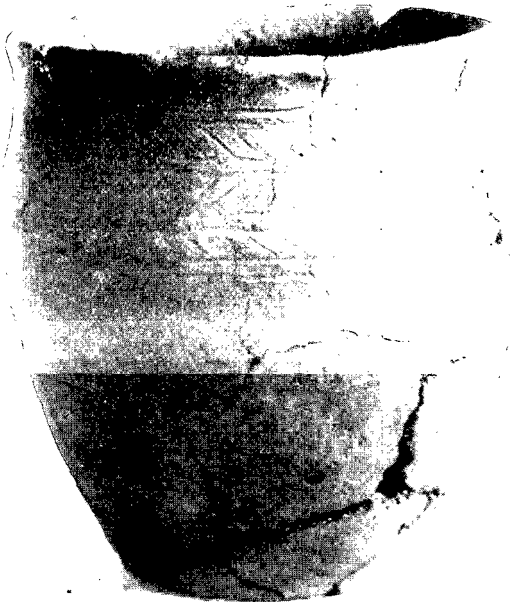
Fig. 2. Urn from the Cist at West Links, North Berwick.

As to the position of the urn, in relation to the skeleton, I must