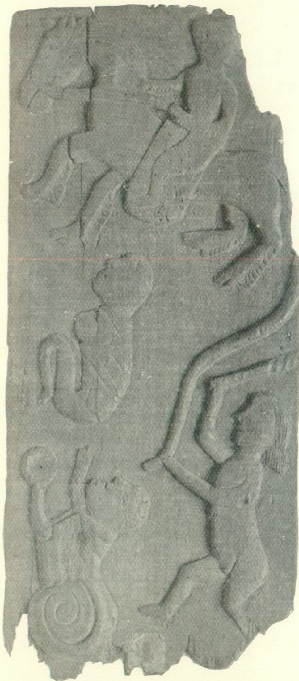
Fig. 2. Carved Panel of oak from Balmerino. (1.)