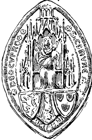
Fig. 2. Seal of the Chapter of Coupar Abbey.