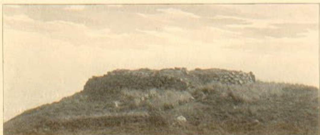
Fig. 2. View of Borgadail Fort from the north.