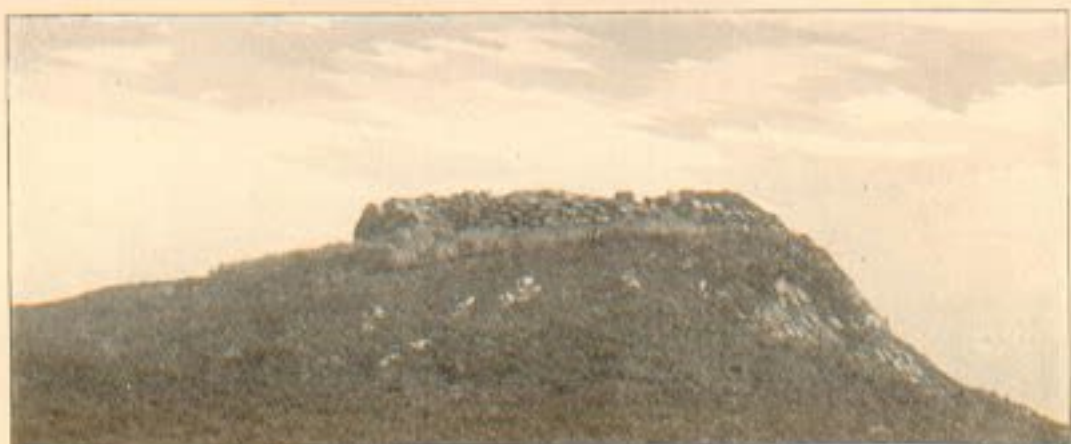
Fig. 1. View of Borgadail Fort from the north-west.