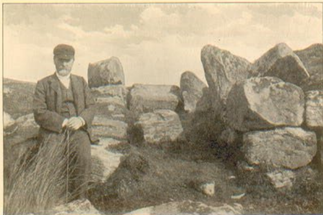
Fig. 3. Doorway of Borgadail Fort, north-west side.