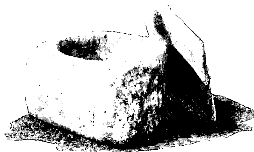
Fig. 1. The 'Wallace Stones'—a knocking-stone with its cover. ( \frac{1}{15} .)

larger of the two stones (fig. 1), which is the only one described or referred to usually in giving the tradition, is what was known amongst country people as a 'knocking-stone'—a stone mortar for husking or preparing barley for cooking purposes. It measures externally about 15 inches across, by about 10 inches in height. The basin or hollow in the stone is 9 inches in diameter at the top, slightly less at the bottom, and 6\frac{1}{2} inches in depth. Apart from the hollow, the stone has not otherwise been shaped or dressed. It is a rudely rhomboidal block, apparently of Kingoodie 1 sandstone, the edges and angles rounded by the weather or attrition.