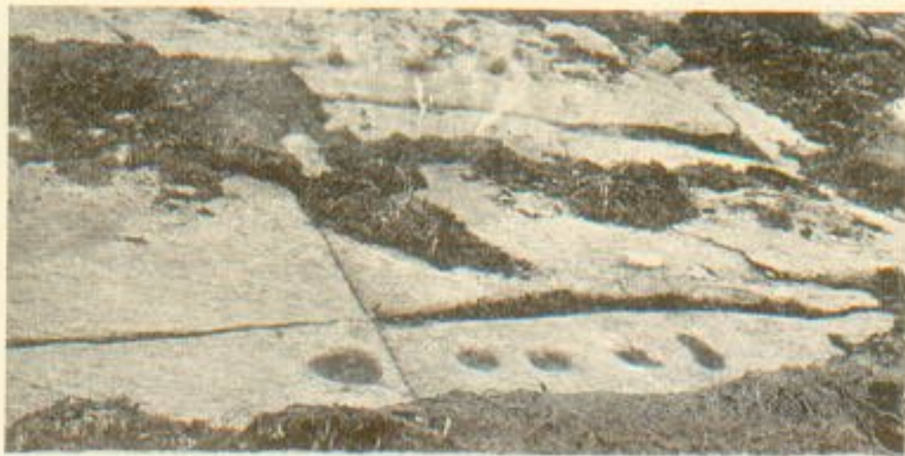
Fig. 2. Two rows of cups in a rock-surface on Braes of Balloch.