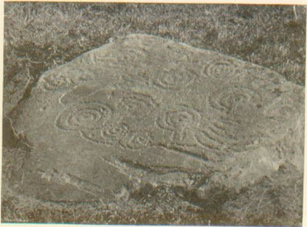
Fig. 1. Boulder with cup- and ring-markings, on Braes of Balloch.