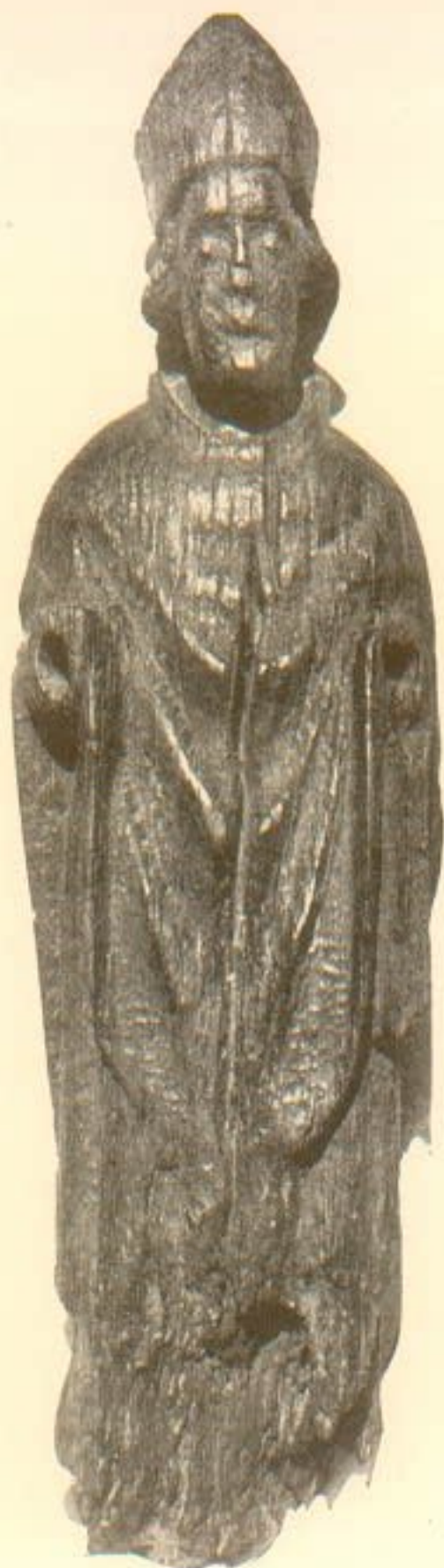
Fig. 2. Wooden Effigy of an Ecclesiastic found in a moss near Whithorn. (1.)