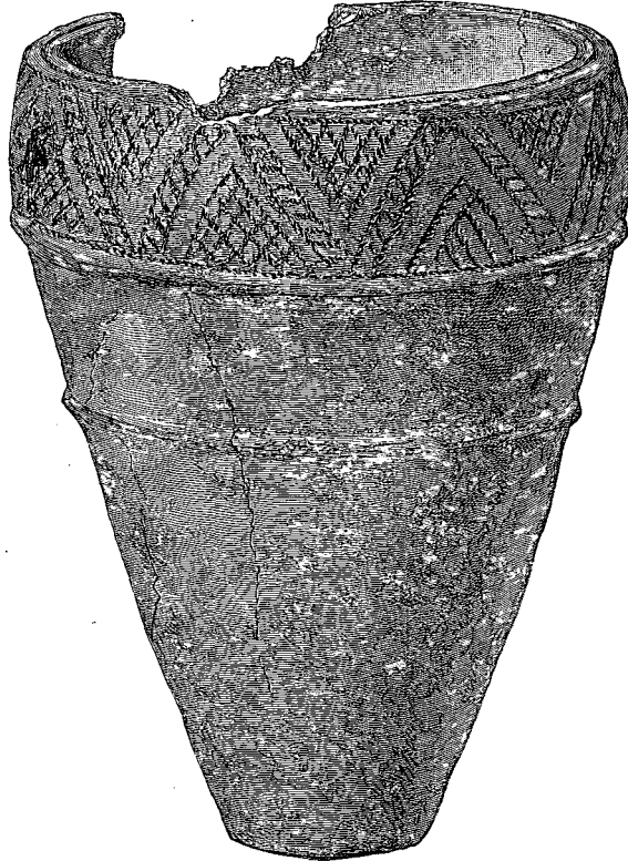
Fig. 1. Cinerary Urn found near the M'Kelvie Hospital, Oban. ( \frac{1}{8} .)

Large Cinerary Urn (fig. 1) measuring 20\frac{1}{8} inches in height, by 14 inches in diameter at the mouth, ornamented on the upper part with an irregular pattern of impressed lines arranged in chevrons. The upper part of the urn is nearly vertical, and the lower part tapers in a flower-pot shape