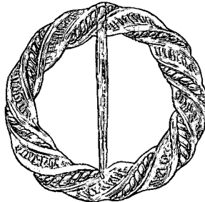
Fig. 1. Gold Brooch, found in the Water of Ardoch, near Doune. (Actual size.)

+ abez de + moy mercie + et pite moun coer en + bouz repose