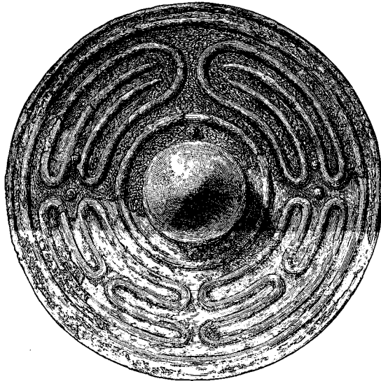
Fig. 3. Bronze Shield found in the Moss of Achmaleddie, New Deer, Aberdeenshire. (†).

boss 4\frac{3}{4} inches diameter and 1\frac{3}{8} inches in height, found with the former shield. It has a moulding concentric with, and about an inch within, the raised edging round the circumference, and another round the central boss, the space between these mouldings being ornamented by four groups of meander-like figures formed by a similar moulding in repoussé . The two upper groups, however, differ from the two lower in not being continuous, but terminating in pointed ends. In its general character