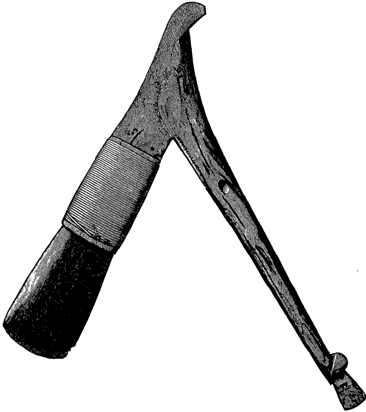
Fig. 2. Stone Axe, in its wooden handle, from New Guinea.

amount of information which may come to cluster round a single specimen if its history be worked out on scientific lines. Take, for example, this stone axe. The statement "it had come, perhaps, from