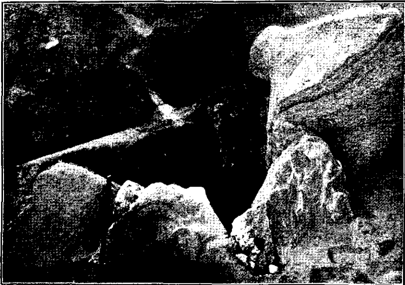
Fig. 1. View of Cist at Easterton of Roseisle, looking North-West.

sizes. The flat stones at the sides were thickish slabs of sandstone, on which were built similar slabs, all of them unshapen, and the height was about 3 feet. There was only one upright stone about 4 feet high. The sculptured stone (figs. 3 and 4), set on edge, with the mirror, sceptre, &c., facing the interior, formed the west side. Although the cist had been first opened in December 1894 by Rev. Mr M'Ewen, F.S.A. Scot., and Mr