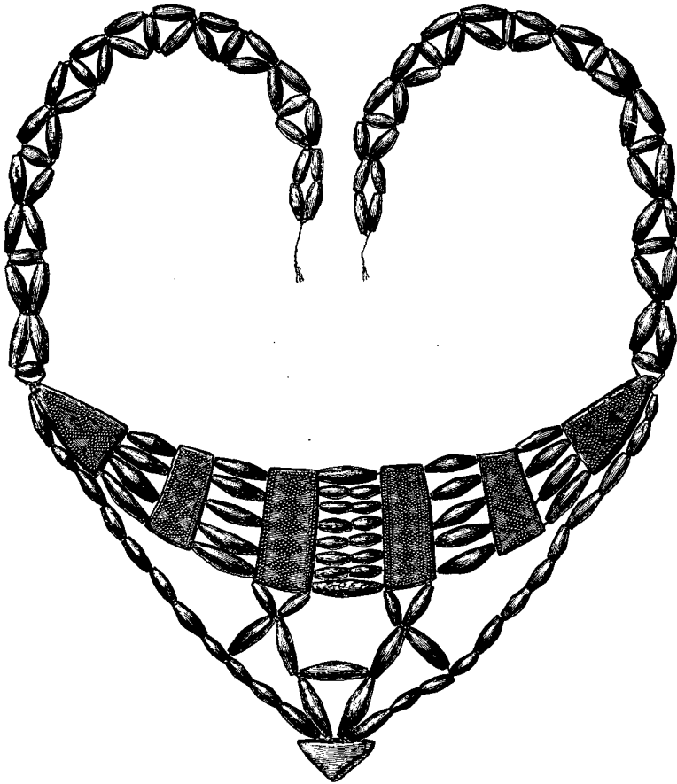
Fig. 1. Necklace of Jet Beads and Plates found in a cist at Balcalk, Tealing. VOL. XXV. E