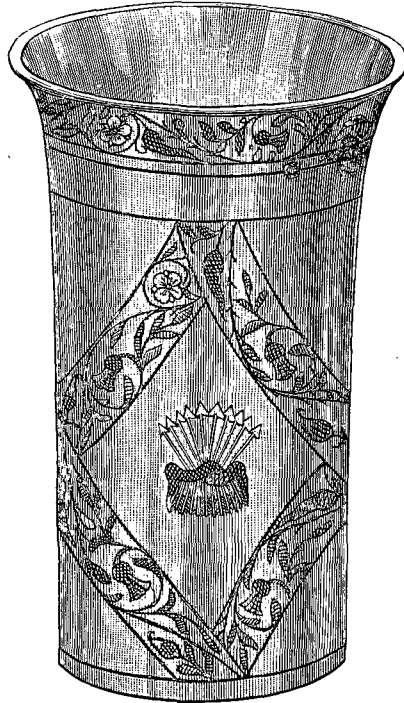
Fig. 1. Communion Cup of the Scots Church, Campvere (scale one-half).

under the Scottish standard, but is quite equal to that of most of the silver plate which comes from the Netherlands.