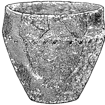
Fig. 3. Urn 6\frac{1}{2} inches in height.

As there seemed to be nothing else likely to be found in the centre of this cairn, the trenches were filled up, and the cairn to the north was treated in a similar way, cutting two trenches from the west and south to meet in the centre. The stones which formed the outer circle of this one were much larger than in the other. In a very short time the workmen came upon the pieces of a very plain urn, 6\frac{1}{2} inches in height and 4 inches in diameter, with no ornamentation except a few dots round the shoulder, as in the accompanying figure (fig. 3). There was a quantity of bones in small pieces lying around the urn. Near it also was a large flat stone, 3 feet by 2\frac{1}{2} feet in size, which, on being carefully lifted, exhibited a layer of small pieces of bone resting on a second but smaller slab of stone, and on lifting this, another layer of pieces of bone, resting on another and still smaller stone, which was at the bottom of a sort of pit or well cut in the solid rock, and sinking 3 feet below the upper or natural surface of the ground. On reaching the centre of the cairn there was no urn or cist as in the other, so the trenches were filled up, and further examination left until another time.