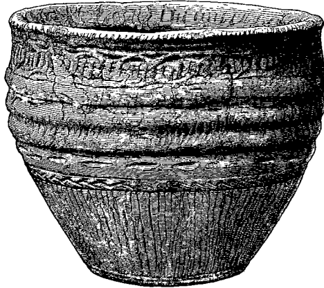
Fig. 2. Urn 6 inches in height.

floor of the trench. At first the labourers pierced through a circle of small stones which has apparently fallen at different times from a cairn, of which it was evident the mound at one time had been the base. They then came upon a ring of large pieces of rock, chiefly quarried in the neighbourhood. Very few travelled boulders were found among them, but inside the ring, which had apparently formed the outside base of the cairn, were heaped up stones of all kinds, among which was found a flat stone with cup-markings and the peculiar dotted appearance caused by the peculiar sculpturing. On approaching the centre, the floor