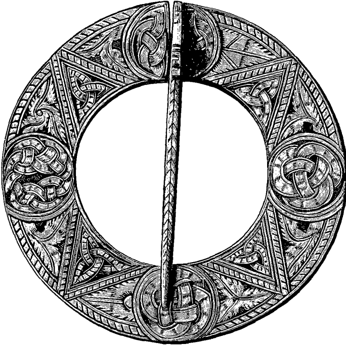
Fig. 3. Highland Brooch of Brass ( 5\frac{1}{8} inches diameter).

The brooch (fig. 3) is circular, made of brass, and measures on the outside 5\frac{1}{8} inches and on the inside 2\frac{7}{8} inches. Its decoration, which is incised throughout, consists on the front of four circles of interlaced work placed at equal distances, divided by four triangular panels, each enclosing a triquetra, the spaces on each side of the triangles being filled