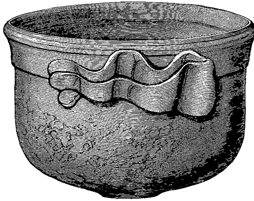
Fig. 1. Glass Cup, from a Stone Coffin at Peterborough ( 2\frac{1}{4} inches in height).

The cup, as shown by the engraving in fig. 1, is in very good preservation, which curious circumstance marks the discovery of all. Its colour