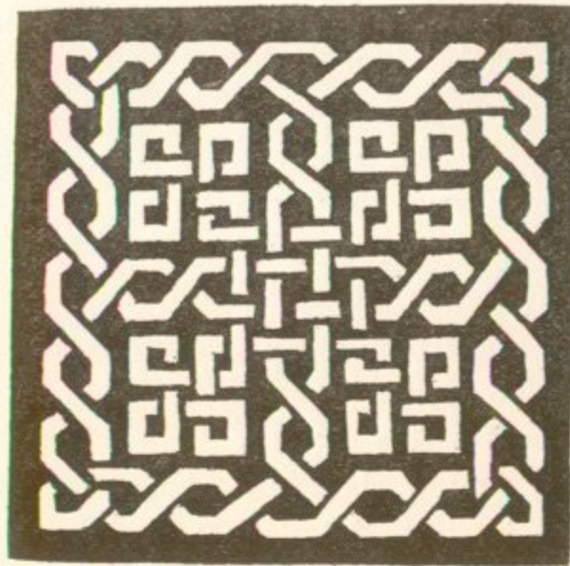
Encaustic Tiles from Fordington St George, and Milton Abbey Churches, Dorset.