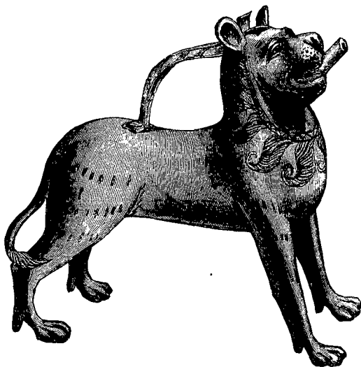
Fig. 1. Lion Ewer of Brass from Nuremberg (10 inches in height).

1. Lion-shaped Ewer of brass, 10 inches high and 10 inches in length, from Nuremberg. It is No. 5 of the series of Lion-shaped