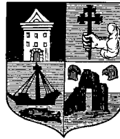
Fig. 3. Shield of Maclean, from the MS. of Sir David Lindsay.

that of Maclean, namely, the two eagles' heads erased affrontée of the third quarter.