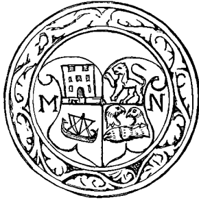
Fig. 2. Shield Engraved in the Bottom of the Cup.

Beyond all doubt, Highlanders were in the habit of assuming, quartering, and impaling arms at their own pleasure, and with little reference to the Lyon King or the rules of Heraldry. Therefore it is somewhat rash to build on inferences to be drawn from the shield. Castles, lymphads, and lions are too appropriate to West Highland life to suggest much; Macleods, Macdonalds, and Macleans all at some time have borne them on their escutcheons. But here we have one charge not to be seen on any West Highland shield, probably not on any Scottish shield, except