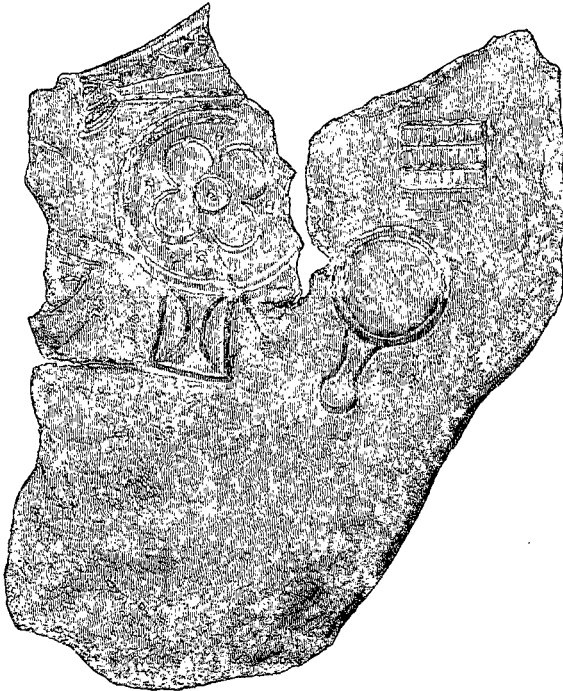
Fig. 2. Sculptured Stone at Glen Urquhart.

Stone No. 2 is evidently a fragment. As it now stands its greatest length is 3 feet 8 inches, and its greatest breadth 2 feet 10 inches.