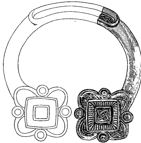
Fig. 2. Portion of a Penannular Brooch of Silver, found at Croy, Inverness-shire (two-thirds of actual size).

gold plate fitted into the panel in the ring has disappeared. The other compartment is of a crescent shape, the outer rim of the crescent being considerably elevated, in a hooded form above the rest, and on the gold plate is a triangular interlaced ornament of filigree work. The end of the brooch expands to a breadth of nearly 1 inch at the extremity, and forms a triangular panel into which is fitted a gold plate secured by two pins at each angle. In the centre of the plate is a raised setting of a leaf-like form, divided into eleven small rectangular compartments by ridges of gold, each compartment being filled with a bright enamel. The space round this central ornament, between it and the outer rim, a breadth of \frac{3}{16} th of an inch, is overlaid with an exquisitely wrought ornament in filigree work very similar to that on the