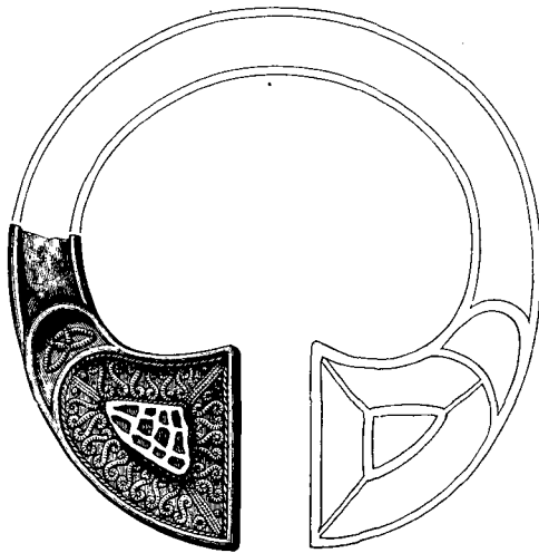
Fig. 1. Portion of Penannular Brooch of Silver, found at Croy, Inverness-shire (two-thirds of actual size).

The articles which I have the pleasure of exhibiting, were found at Croy by Mr James Shearer of Mains of Croy. They were found in 1875, or the following year, in a light gravelly soil, 6 inches below the surface, and near the road leading from Croy to Dalcross Castle.