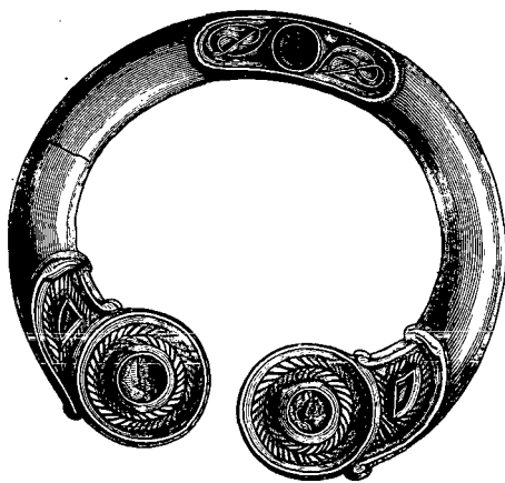
Fig. 4. Silver Brooch, found at Croy, Inverness-shire (two-thirds of actual size).

The articles presented by Rev. Mr Fraser were found by a girl planting potatoes on the summit of a low gravelly ridge in the field where they had been turned up by the plough. They were all found within