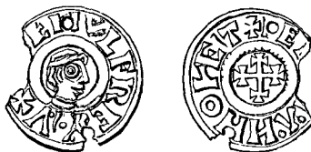
Fig. 3. Silver Coin of Coenwulf, found at Croy, Inverness-shire.

No. 6 is a silver coin of Coenwulf, king of Mercia (A.D. 785–818), bearing on obverse (fig. 3) a rude head in the centre, with the inscription round the margin COENVVLF