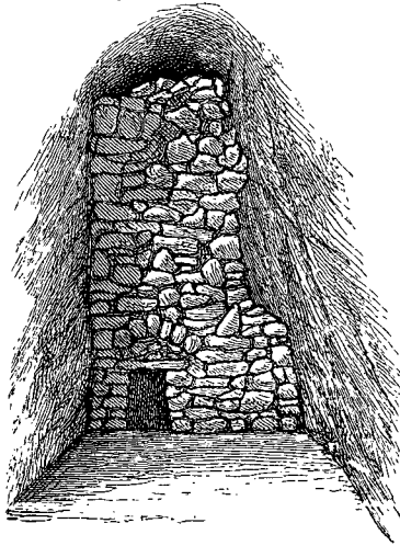
Fig. 2. Wall forming the western gable of St Medan's Chapel, with entrance to the Cave beyond (from a drawing by Dr Arthur Mitchell).

This west wall (fig. 2) is 3 feet 3 inches thick, and has a projecting course of stones along the foot, apparently for supporting a wooden floor, as there are appearances of similar courses having existed along the