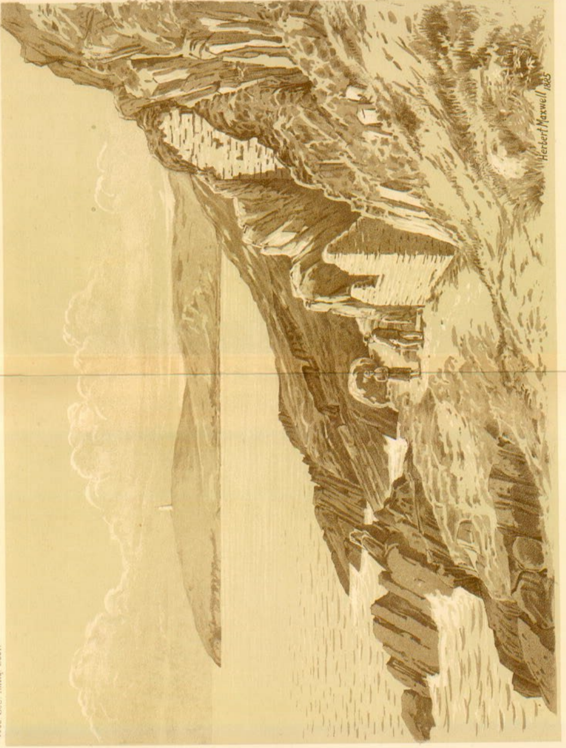
ST MEDANS CAVE AND CHAPEL. KIRKMAIDEN, WIGTOWNSHIRE.