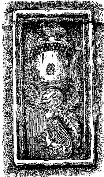
Fig. 1. The Lauder Arms, on south front of Hatton House.