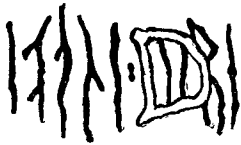
Fig. 1. Runic Inscription in St Molio's Cave.