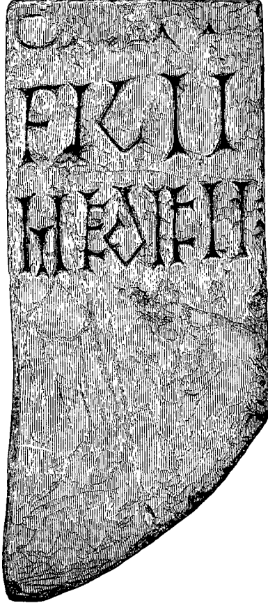
Fig. 2. Portion of Stone Cross found at Lethnott, Forfarshire. Obverse, with Inscription (9 inches in length).

to the style of the manuscripts known as the Gospels of MacDurnan, in the library of the Archbishop of Canterbury at Lambeth, and the Gospels of MacRegol in the Bodleian Library, Oxford, both of the ninth