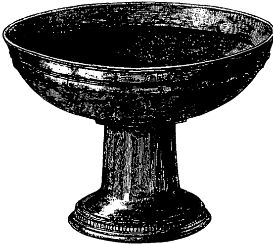
Fig 1. Chalice, St Mary's College, St Andrews.

The silver vessels now exhibited to the Society belong to St Mary's College, in the University of St Andrews.