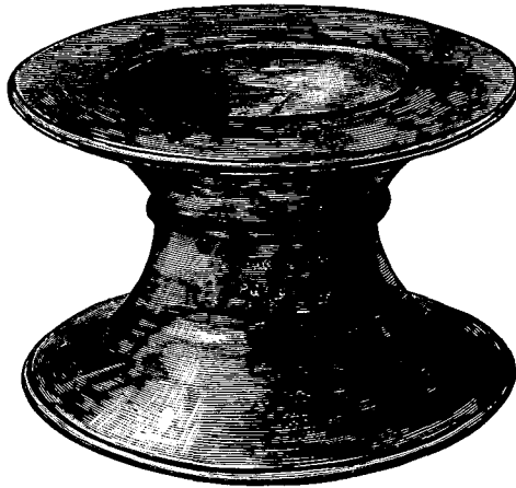
Fig. 3. Silver Salt Cellar, St Mary's College, St Andrews.

3. The third article was a silver Dish (fig. 3), 3 inches high by 4\frac{3}{4}