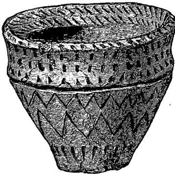
Urn found at Craigdhu, North Queens- ferry (2 inches high).

Small Urn, of the so-called "Incense-cup" type, 2 inches high, 2\frac{3}{4}