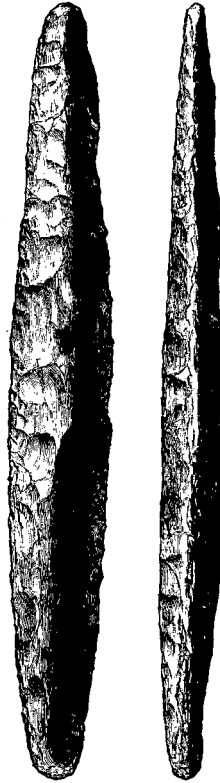
Flint Implement found on the Hill of Co- rennie, Aberdeenshire ( 4\frac{1}{2} inches long).

A Knife of peculiar form used in Aberdeenshire for splitting fir-wood. It has a stout blade 3\frac{1}{2} inches in length by an inch in breadth, firmly