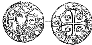
Fig. 3.—Long single cross type of Silver Penny of Alexander.