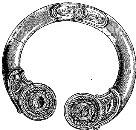
Fig. 1. Silver Brooch found at Croy (3 inches diameter).

The Brooch is of the penannular form, with disc-like ends, characteristic