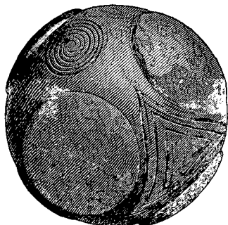
Stone Ball found at Freelands, Glasterlaw ( 2\frac{3}{16} inches in diameter).