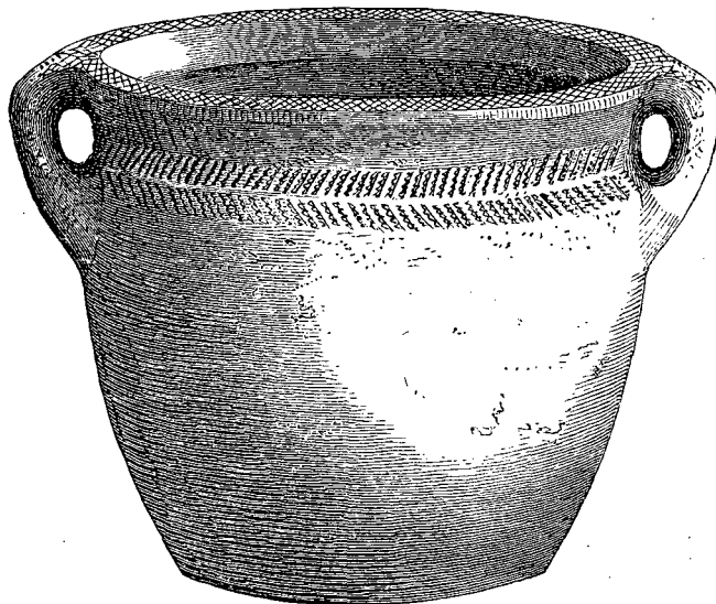
Fig. 2. Fictile vessel from Ballydoo Lough Crannog (restored). (13 inches diameter.)

The mode of ornamentation presents some resemblance to that on silver articles in the Cuerdale hoard, dating somewhere about the 9th century; but, on the other hand, it is not very unlike that of the early sepulchral urns usually found associated with weapons of stone. Mr