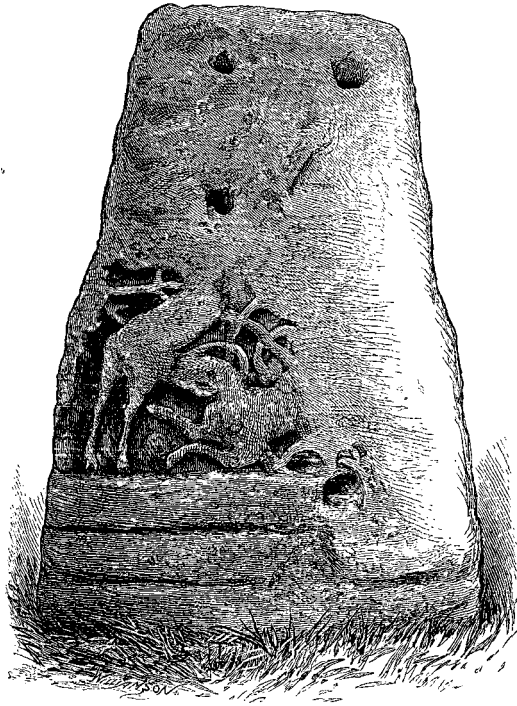
Portion of the Old Cross of Jedburgh, now at Hartrigge (from a photograph).

stone seems to me to be the lower part of the shaft next to the stone steps. On the upper part is a tenon. It is impossible to say the number of parts the cross consisted of, but, I think, it very probable