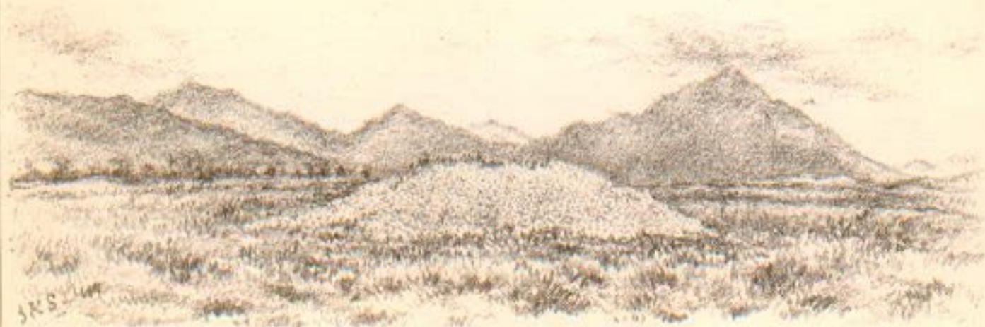
Baron's Cairn - Lochanabeich - Connel Ferry.