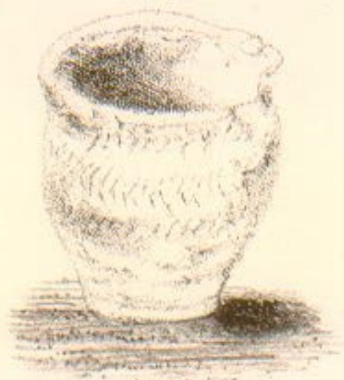
Urn from a cave under Dun Bhaile an Rìgh (Valanree,