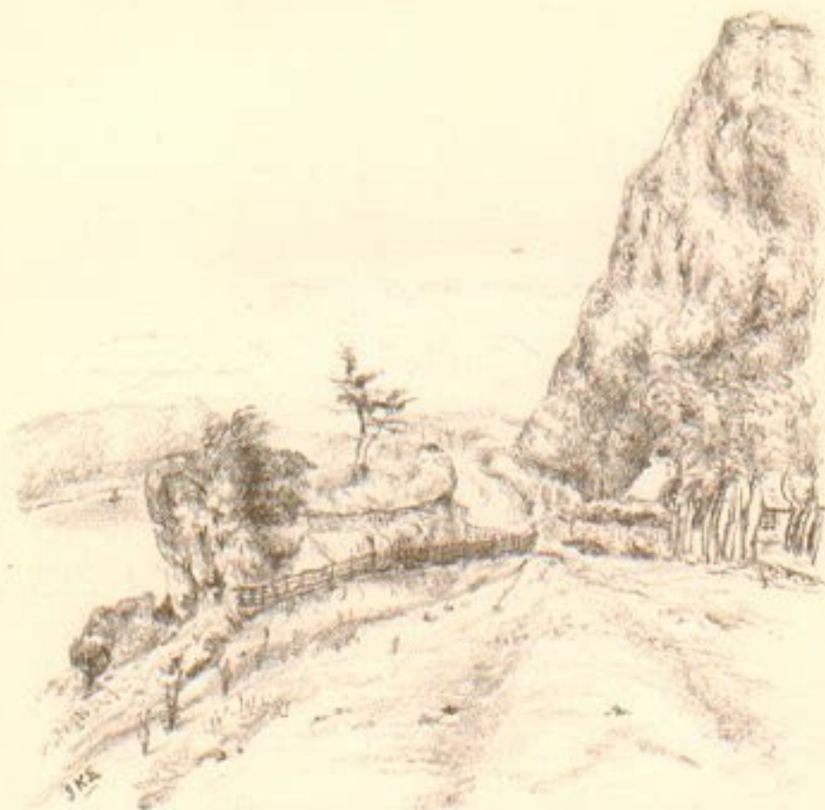
Dun Bhaile an Righ or Dun Valanree - extremity of Ledaig.