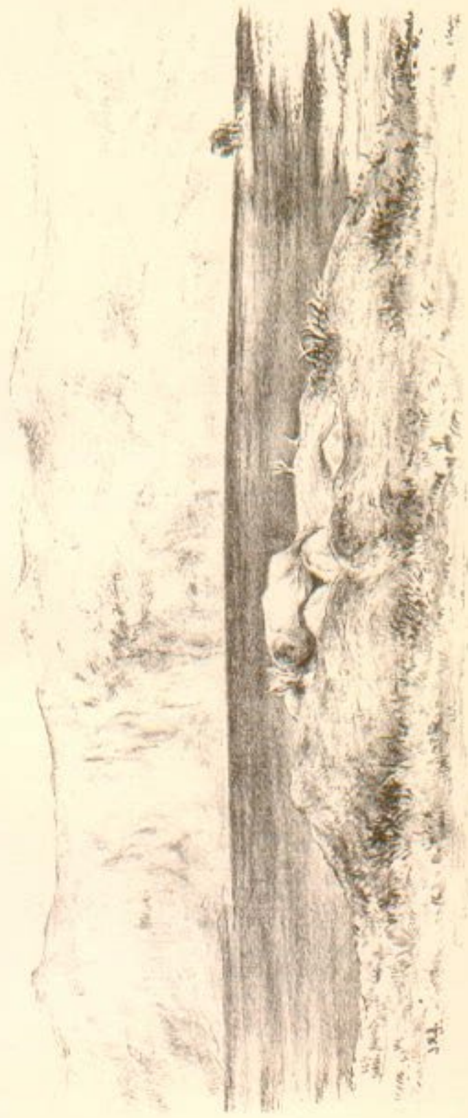
Megalithic double burying place near outlet of Lochnell. The little wooded island to the right was a lake dwelling