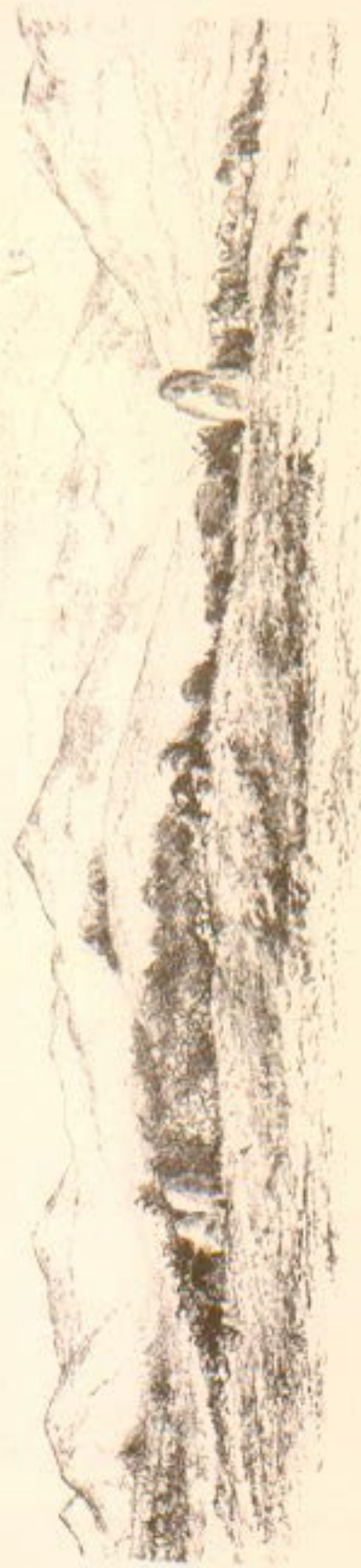
Remains of two double circles at Barvaldine & outline of Appin hills.