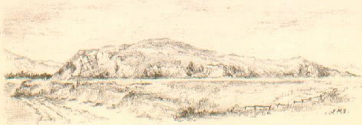
Dun Mac Uisneachan from the shore S.W. fancifully called Beregonium, castle of Fergus and Selma.