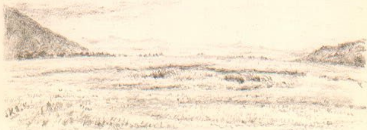
Lake dwelling at Ledcay - (Conna Ferry) the long line is the border of the old lake - The view towards Lashawe with the beginning of Cruachan on the left.