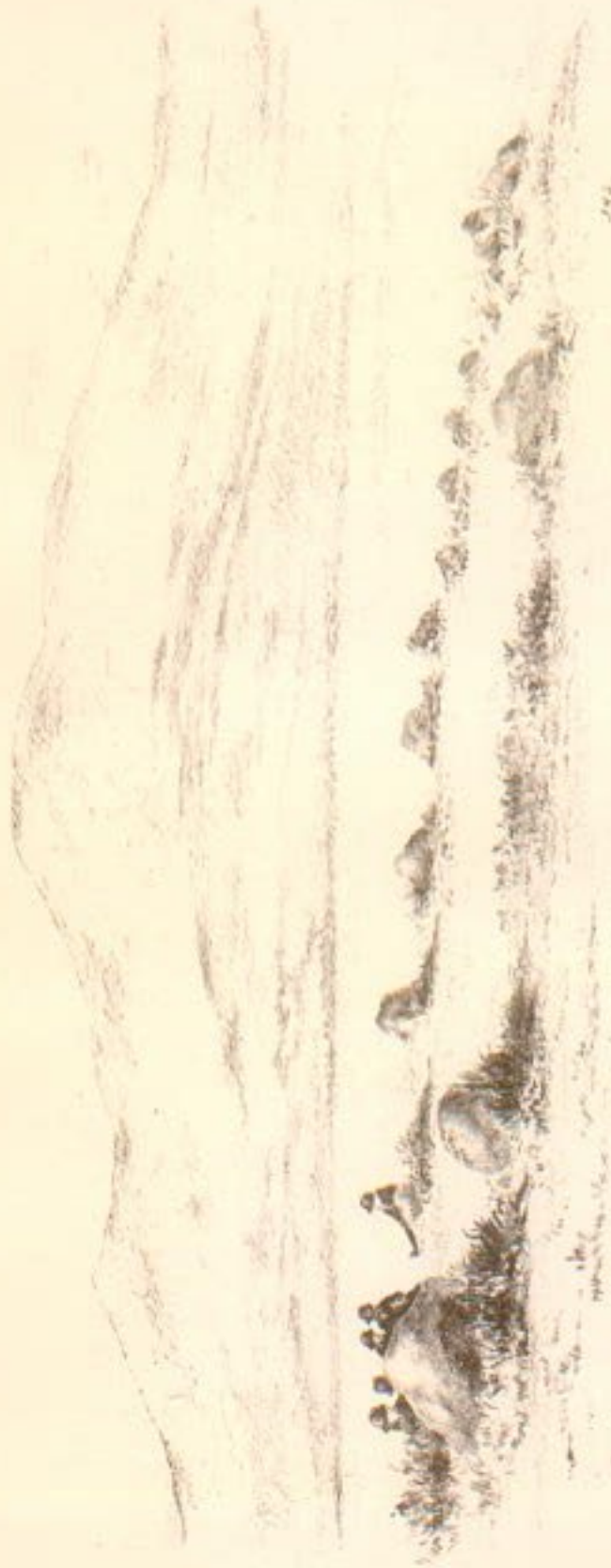
Circle at Cleigh - head of Lochbrell.