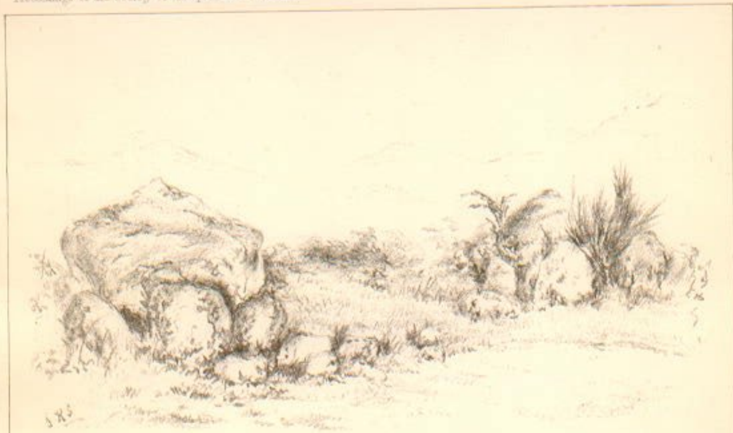
Cromlechs at Achnacridhe beag or Achnacree beg.