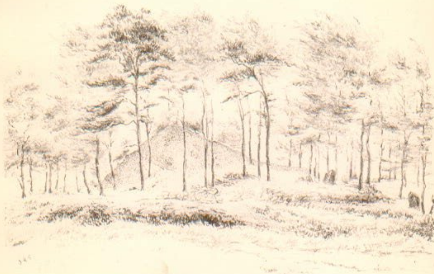
Great Cairn at Achmacridhe (Achnacree)