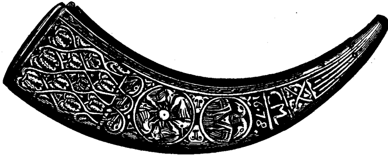
Fig. 3.—Highland Powder Horn.

(4.) Scottish Dagger, single-edged blade much wasted, and stag's horn and iron handle (see the preceding woodcut, fig. 2).