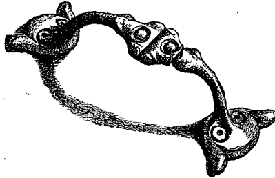
Fig. 2.—Bronze Handle found in Carlingwark Loch.

had been attached, has been torn away. The caldron was dredged up by the donors from Carlingwark Loch, Kirkcudbright, and contained an adze, 7 inches in length, 2 inches across the face (Plate I. fig. 1); three axe-heads, measuring from 4\frac{1}{2} to 5\frac{1}{2} inches in length, and 2 to 2\frac{1}{2} inches across the face (figs. 2, 3, 4)—each of these tools have small projections of the metal on each side of the haft-hole; four small picks or hammers, with narrow extremities, from 6 to 7\frac{1}{4} inches in length (fig. 5), and apparently a broken half of another hammer-head, 4 inches in length; hammer-head with flattened ends (fig. 6); portion of a small saw, 6\frac{1}{2} inches, with blade 1 inch in breadth—a portion of the wooden handle remains riveted to the blade (fig. 7); portion of a fine cut saw, 2\frac{1}{2} inches in length, and 1\frac{1}{2} inch in breadth; nine portions of double-edged blades, with pointed extremities resembling sword points, from 2\frac{1}{2} to 6 inches in length, and from 1\frac{1}{2} to 2 inches in breadth; nails of various lengths, one with a large head, with a cross marked on each side (fig. 8); small slender chisel, 5 inches in length, \frac{3}{4} of an inch across the face; portion of another