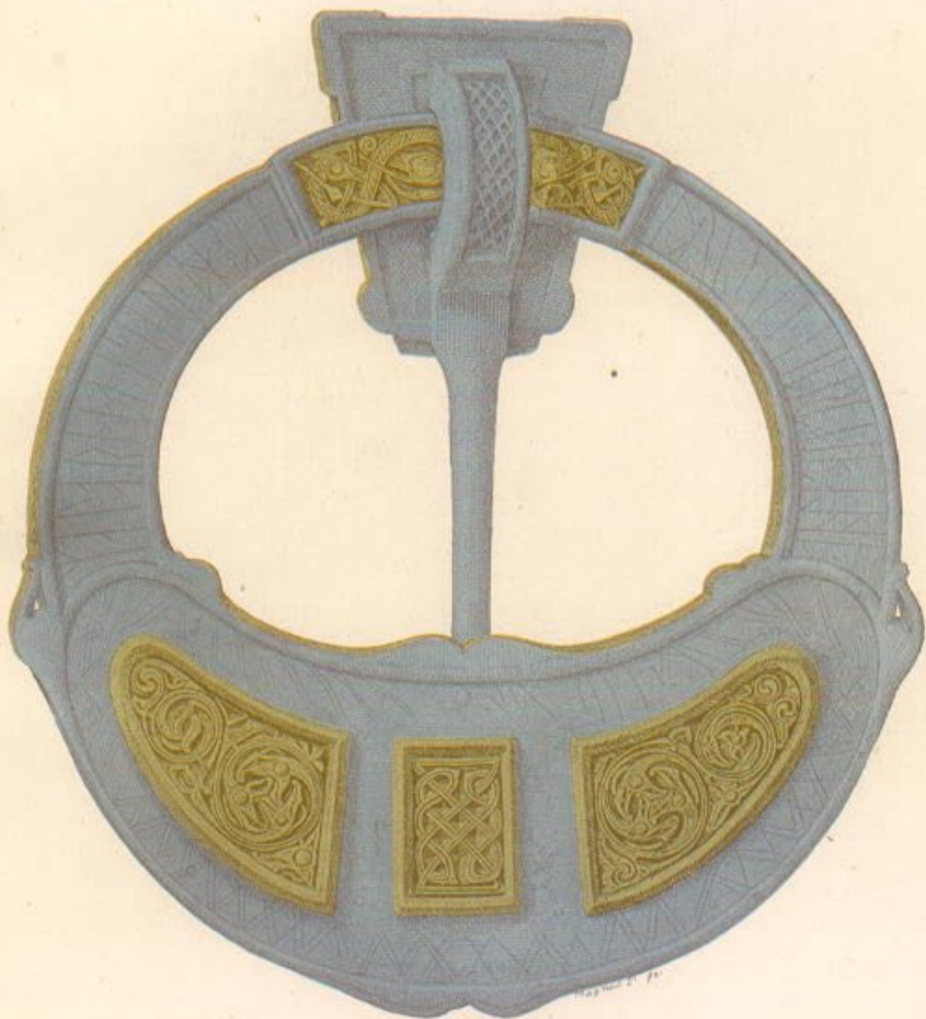
HUNTERSTON BROOCH. Back.