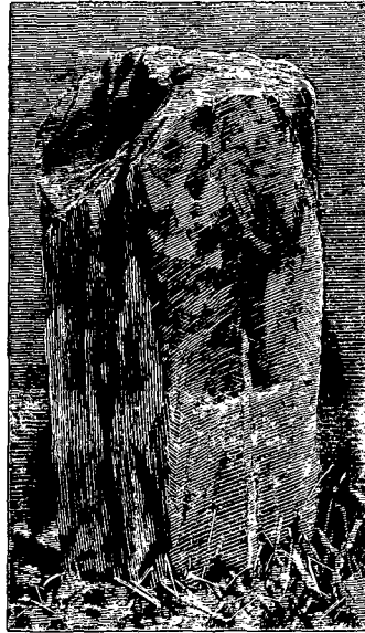
Stone with Incised Cross in Strowan Churchyard.