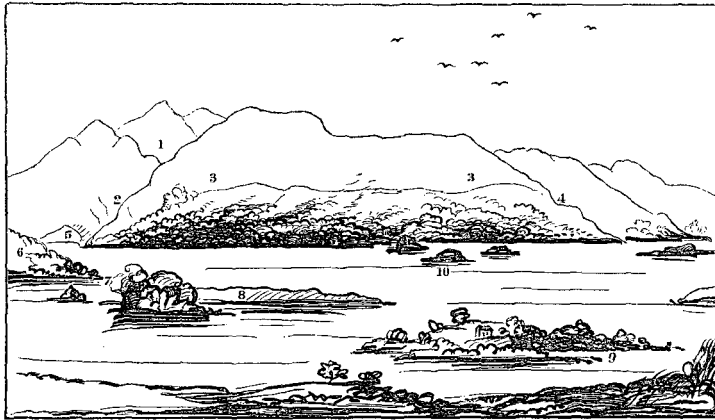
Lochawe and Cruachan from the heights above Cladich.

Beinn-Cruachan consists, as its name imports, of an aggregate of "Cruachs," or hill-stacks, each of which has its own distinguishing name. Thus Cruachan proper, with its three culminating peaks, rises in the background from the shores of Loch Etive (1 of diagram).