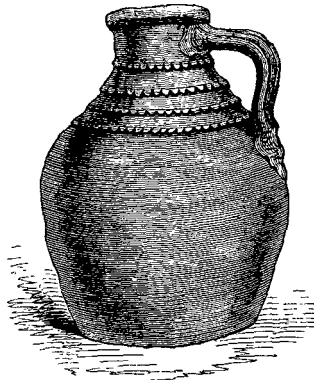
Earthen Jar containing Coins; found at Kinghorn.

"They were found while levelling some ground close to the old mansion-house of Abden, which, though probably not in its present form of an older date than the beginning of last century, occupies the site of much older buildings; and on the spot, or near it, the early Scottish kings possessed a hunting-seat. The workmen engaged in removing the earth a few yards to the south of the Edinburgh, Perth, and Dundee Railway, found an earthenware vessel, something like the accompanying figure. Thinking it a stone, they struck it with a pick, and some coins falling out, in the scramble that